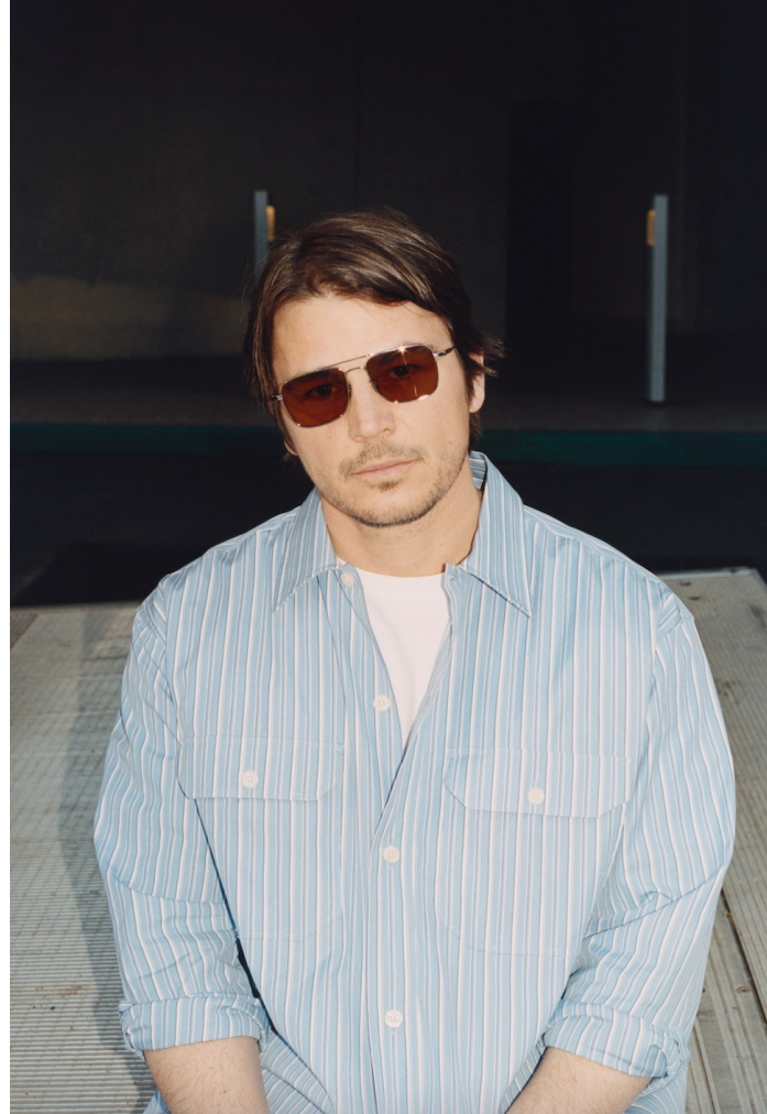
Shirt: MFPEN T-Shirt: Acne Studios Sunglasses: Brioni