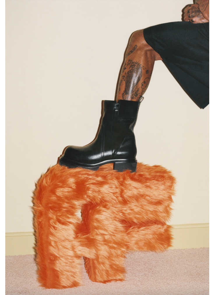
Boots: Rick Owens