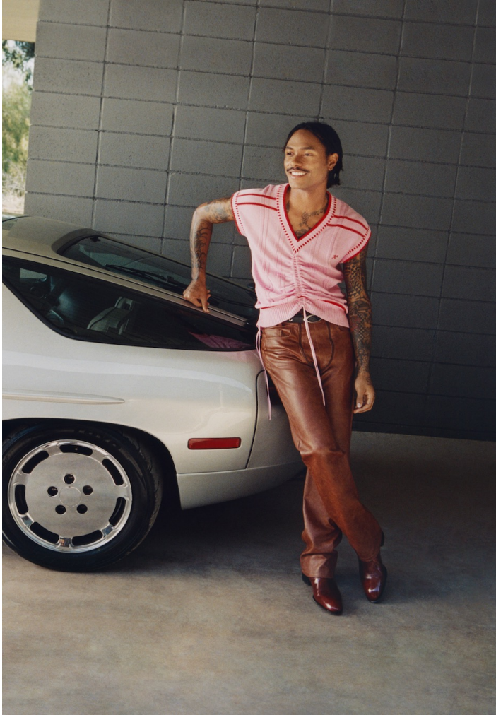
Top: GMBH Trousers: GMBH Belt: Marine Serre Boots: Giuseppe Zanotti