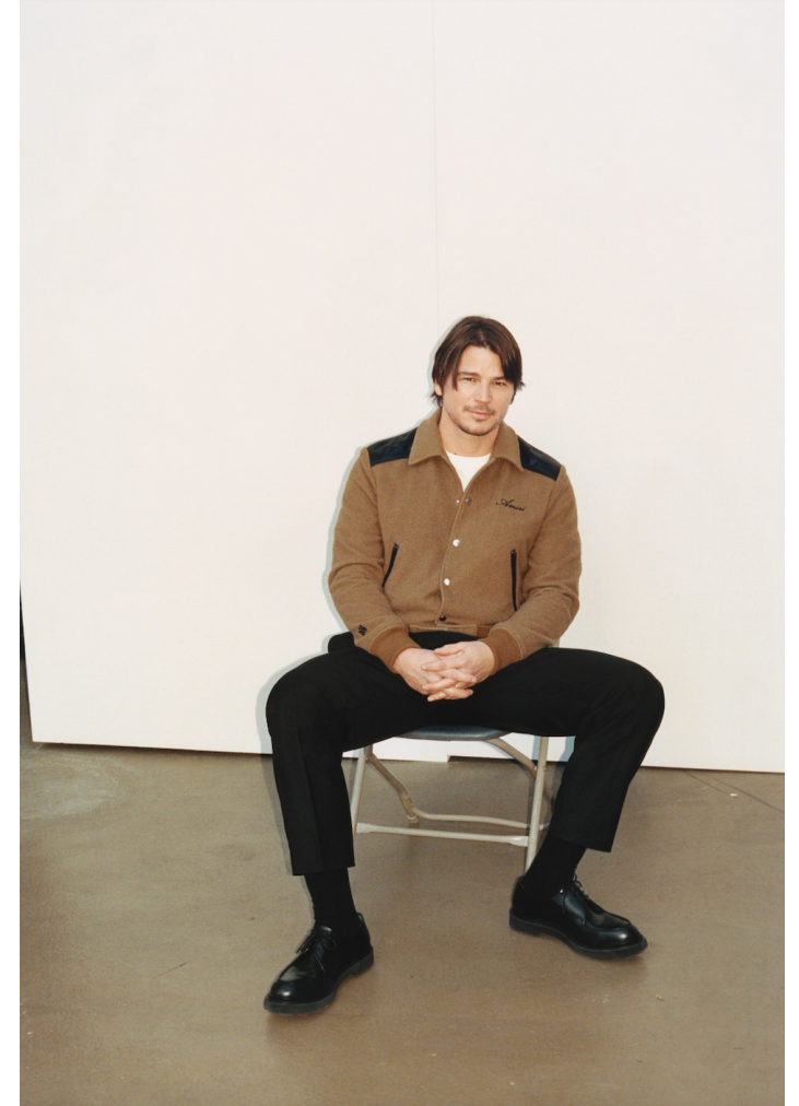
Jacket: AMIRI T-Shirt: Acne Studios Trousers: Maison Margiela Shoes: Adieu