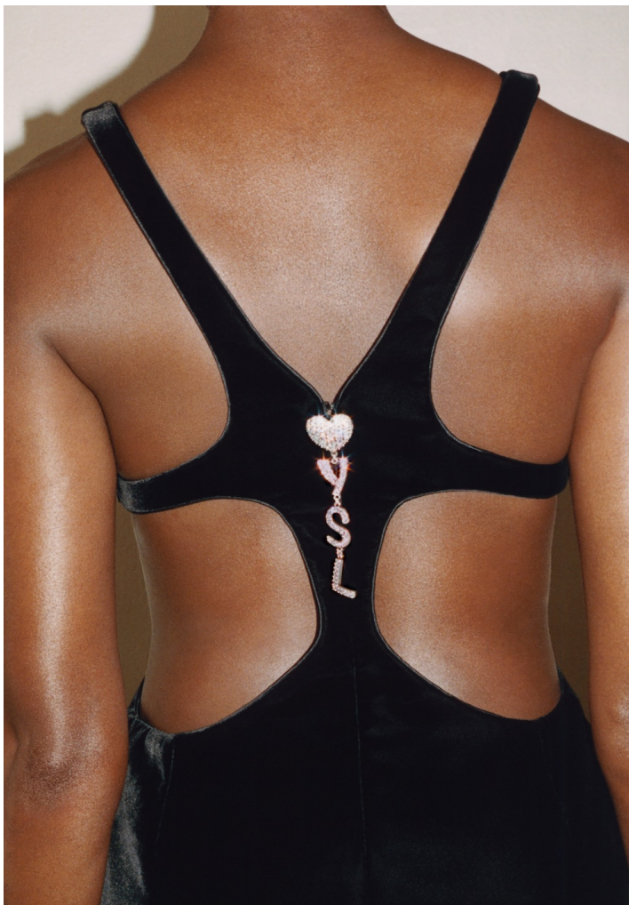
Dress: Yves Saint Laurent