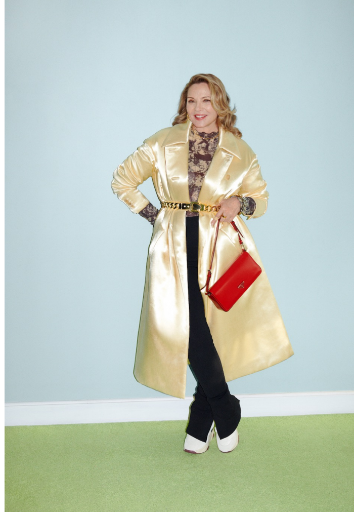
Coat: KHAITE Top: KNWLS Leggings: KHAITE Sneakers: Isabel Marant Bag: Prada Ring: Bleue Burnham Earrings: Completed Works