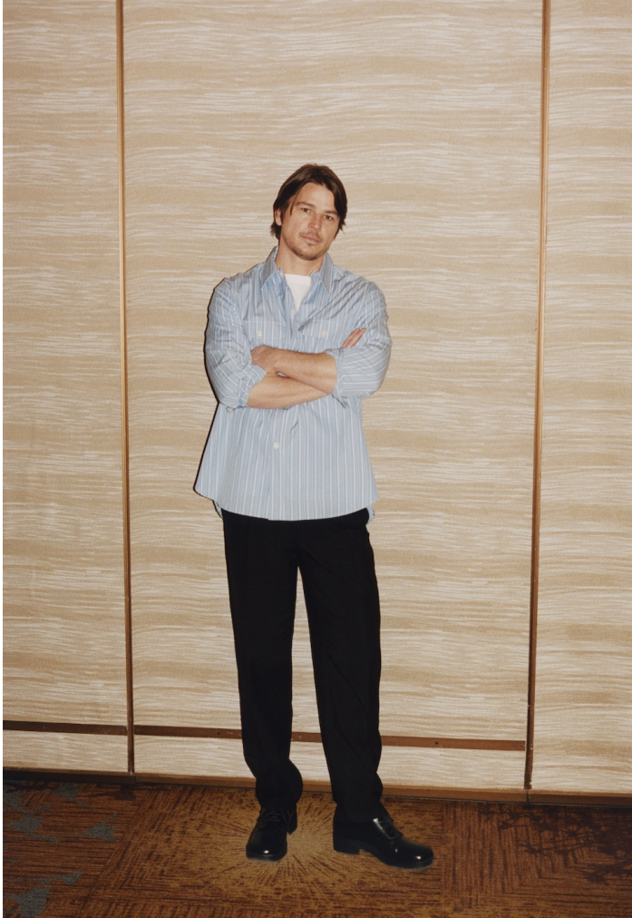
Shirt: MFPEN T-Shirt: Acne Studios Trousers: Acne Studios Shoes: Prada